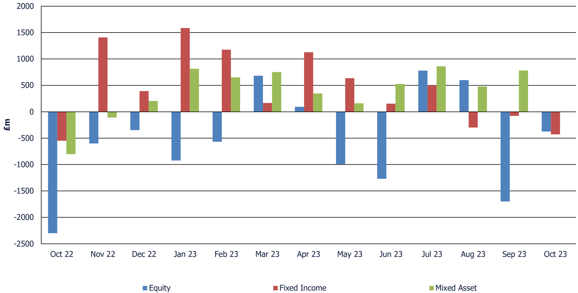
CHART B: NET RETAIL SALES BY ASSET CLASSES (UK DOMICILED FUNDS)